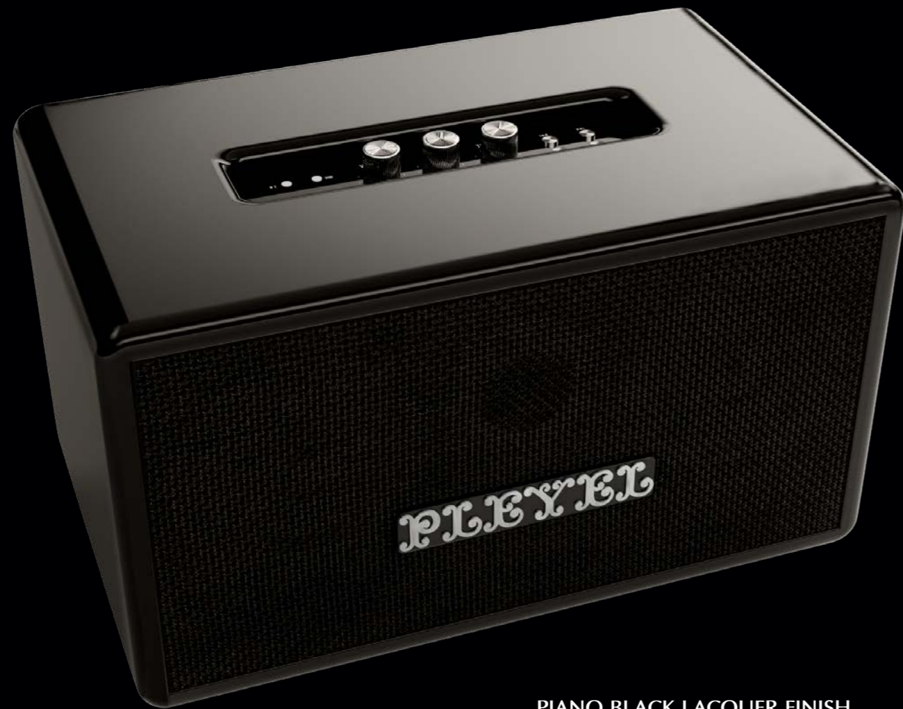
PIANO BLACK LACQUER FINISH IMP250BLK

The House of Pleyel is proud to continue its famous sound through the IMPERATOR 250 and enhances its first speaker with a black or white lacquer finish, reminiscent of the brand's pianos.