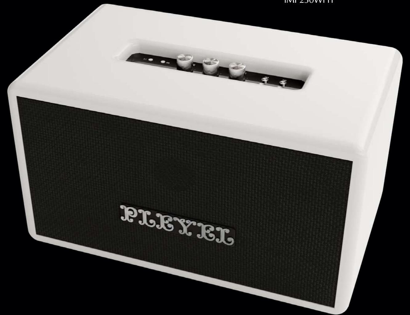
PIANO WHITE LACQUER FINISH IMP250WHT

Dive into a unique sound experience with the IMPERATOR 250, where power and clarity blend perfectly. Its modern and sleek design fits in any interior.